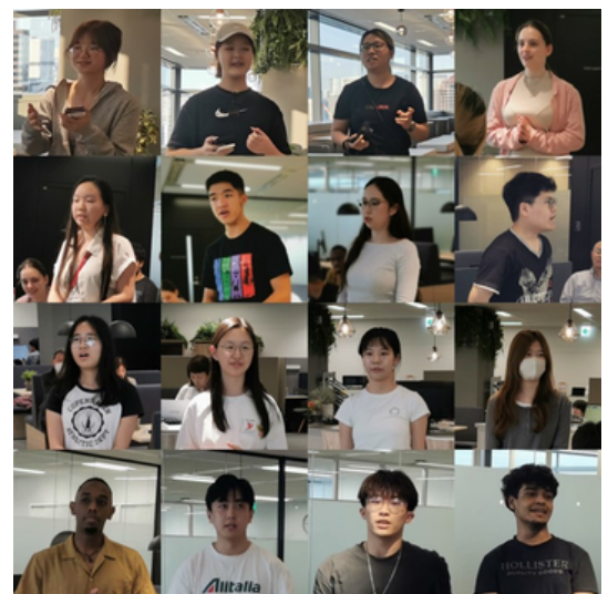
Our students shared their thoughts after listening to the presentations