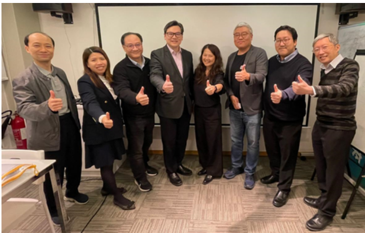
Appreciation from the Chapter's President, EVPs and VPs