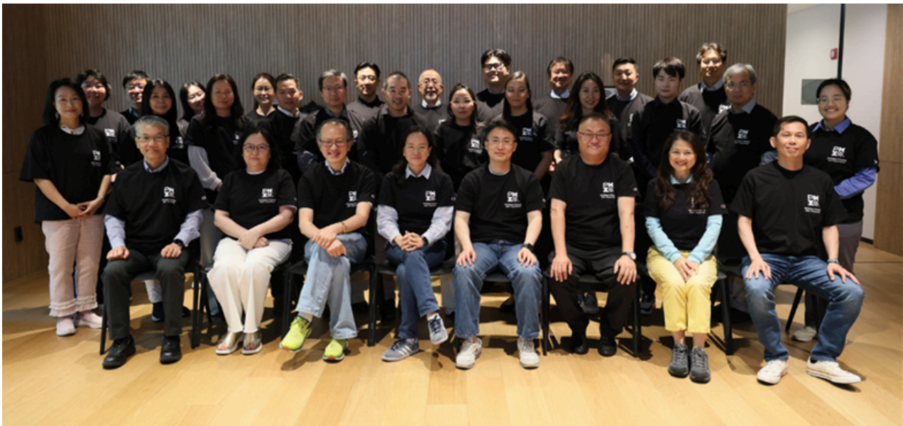
Closing group photo

This PMI Region 9 Meeting in Seoul exemplified the power of collaboration, innovation, and a shared vision for the future of project management in Northeast Asia. The surge of insights, connections, and initiatives arising from this gathering will undoubtedly have built a legacy of positive impact on the professional development and success of project managers across the Region.